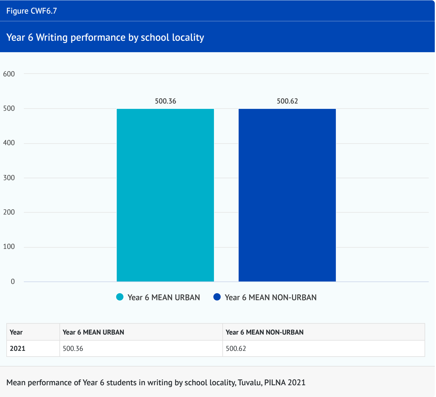
Figure CWF6.7 shows the average writing performance of year six students by school locality. In PILNA 2021, year six students in urban schools scored about the same as those in non-urban schools. This is different from the findings in PILNA

A roughly equal number of year six students who had their performance analysed in the PILNA 2021 writing assessment were enrolled in urban schools and non-urban schools: 52% in urban schools and 48% in non-urban schools.