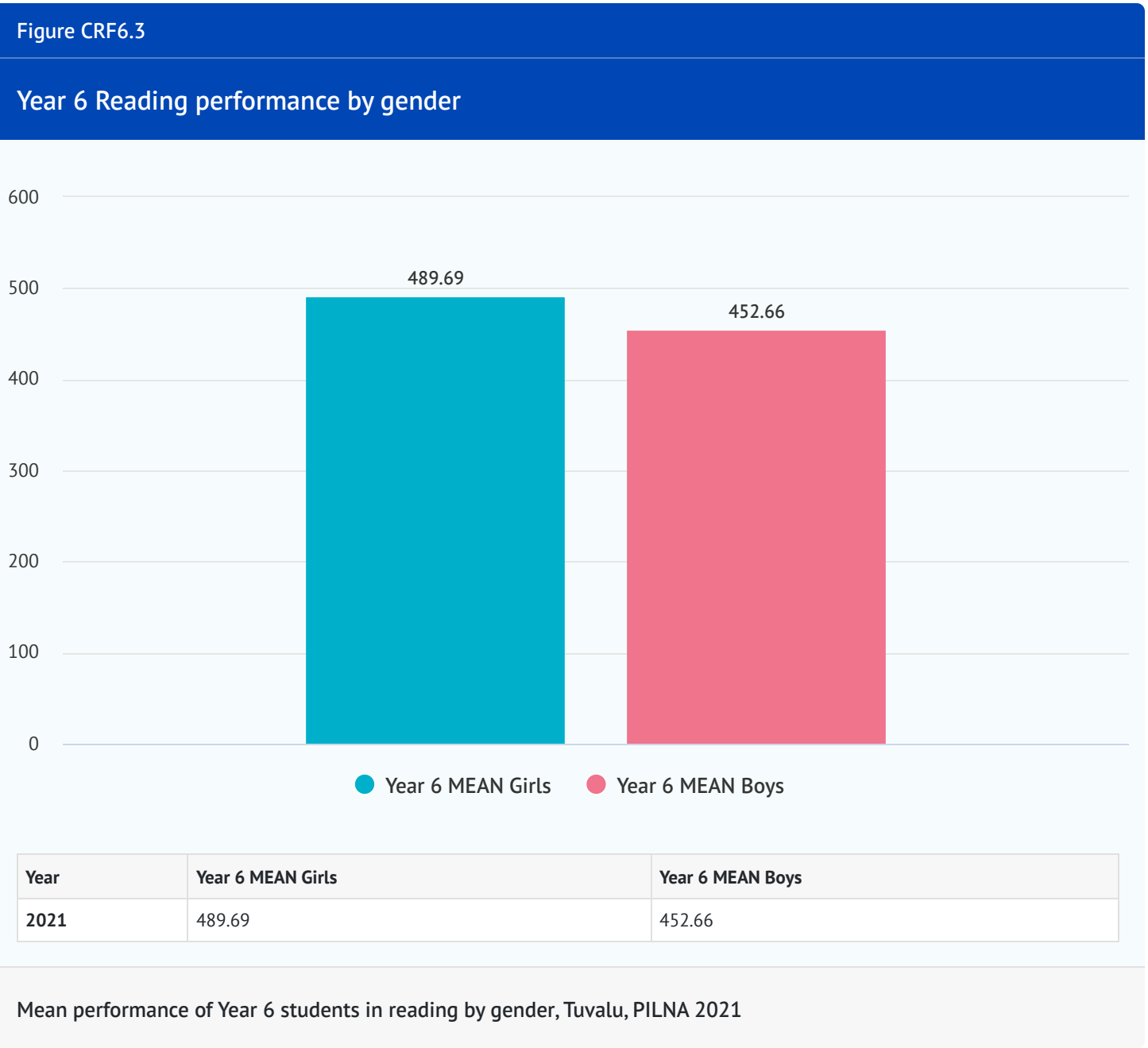
Figure CRF6.3 shows the average reading performance of year six students in Tuvalu by gender. On average, year six girls (489.69, SD = 74.84) scored higher than year six boys (452.66, SD = 86.73) in PILNA 2021. This was similar to the 2015 and

A roughly equal number of year six girls and boys in Tuvalu had their performance analysed in the PILNA 2021 reading assessment: 48% girls and 52% boys.