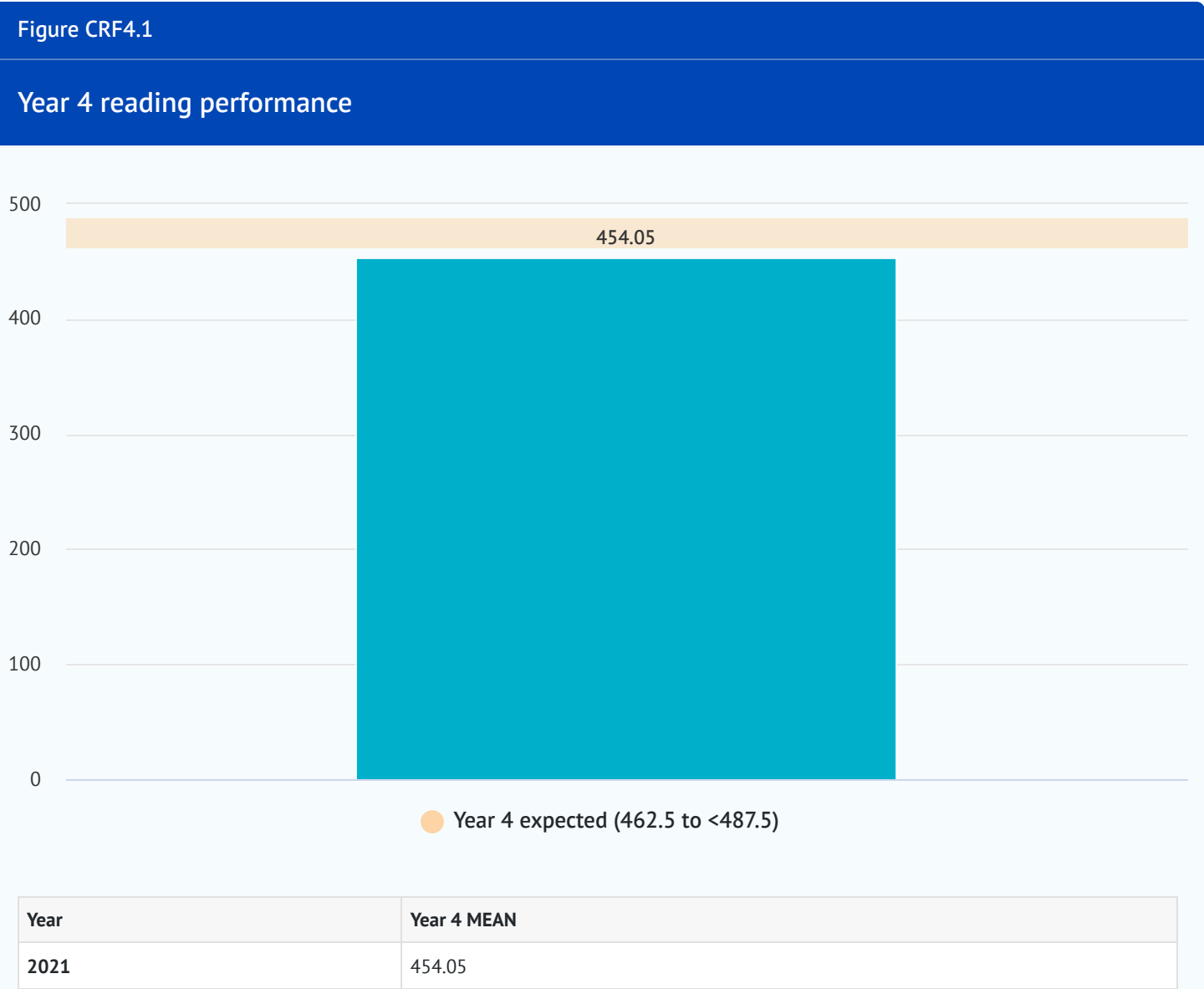
Mean performance of Year 4 students in reading, Tonga, PILNA 2021

The average reading performance for year four students in Tonga in 2021 was 454.05 (SD = 56.51).