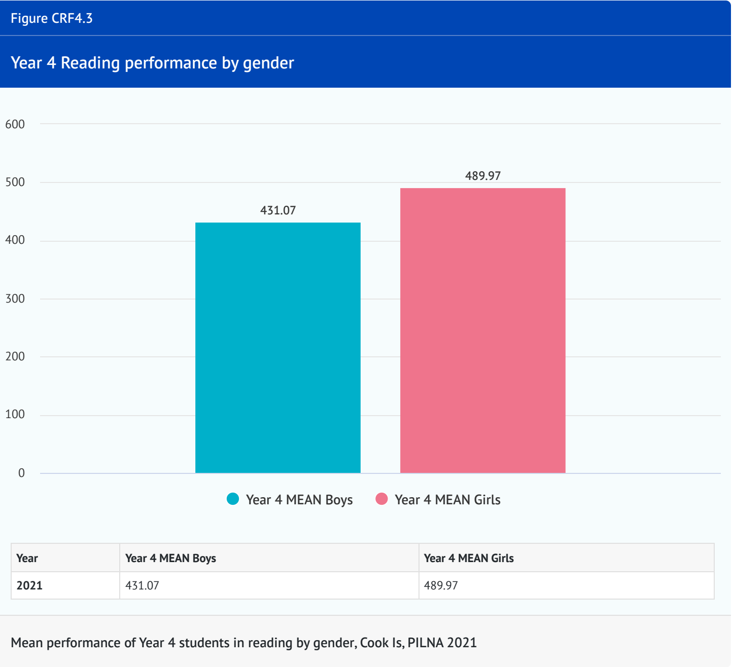
Figure CRF4.3 shows the average reading performance of year four students in Cook Islands by gender. On average, year four girls (489.97, SD = 102.80) scored higher than year four boys (431.07, SD = 114.76) in reading. This is consistent with the

A roughly equal number of year four girls and boys in Cook Islands had their performance analysed in the PILNA 2021 reading assessment, with the distribution being 46% girls and 54% boys.